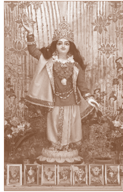
Śrī Śrī Guru Gaurachandra, the presiding Deity at Śrī Chaitanya Sāraswat Mission in Salt Lake City, Utah.

kṛṣṇa-varṇaṁ tviṣākṛṣṇaṁ sāṅgopāṅgāstra-pāṛśadam yajñaiḥ saṅkīrtana-prāyair yajanti hi sumedhasaḥ ( Śrīmad Bhāgavatam: 11.5.32 )