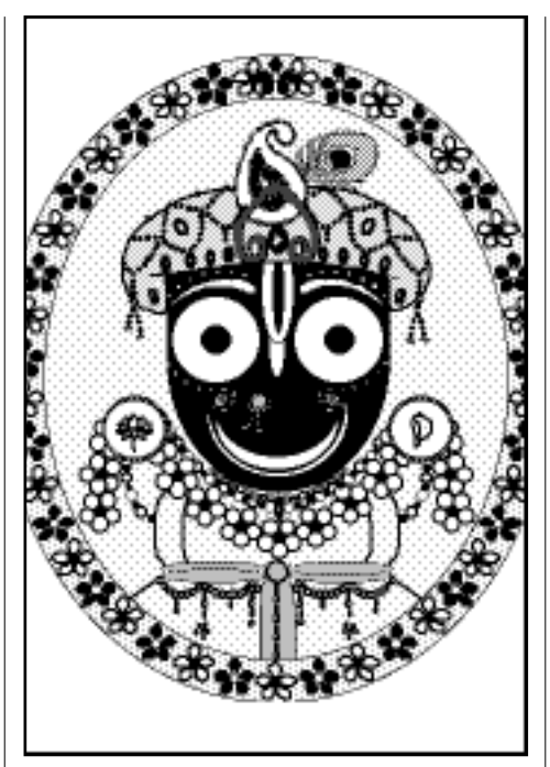
Jagannathdev, the Lord of Puri Dham

me, and You are eager to give, then please give me this: that I shall not be again within the illusion of desiring anything. Please don't permit me to ask You for anything again. Please demolish that type of desire from my heart." This should be our prayer and this is ananya-bhakti <sup>†</sup> in santa-rasa .