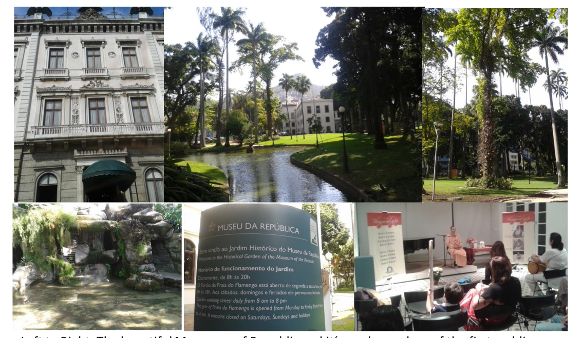
Left to Right: The beautiful Musueum of Republic and it's garden – place of the first public leacture of Srila Trivikrama Maharaj at Rio de Janeiro.

On this beautiful and historical place, built on 1858 (was a former government palace), took place the first public preaching of Srila Trivikrama Maharaj at Rio de Janeiro.